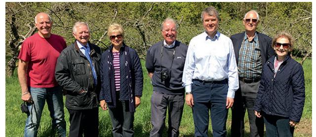
Tranquil: The beautifully restored pond. Above: Past and present councillors admire the orchard.