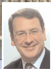
By Mark Hoban MP for Fareham

You have to make difficult decisions in your life, which require a sacrifice today to achieve a better tomorrow. Do you go to college to get more qualifications or straight into work; or sacrifice nights out to repay debt or save for a deposit?