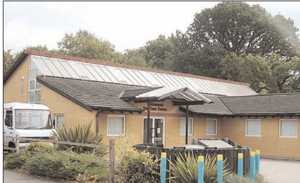
Concern: Elderly users of the Lockwood Centre are worried by Age Concern's takeover.