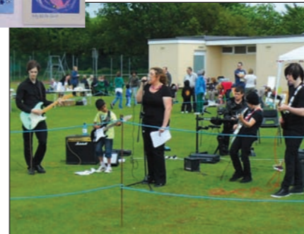
Rock 1 Band gets crowds in the mood on Sarisbury Green.

On Monday, there was a picnic on Sarisbury Green after a drop-in session at St Paul's Church in the morning with organ music played by Mrs