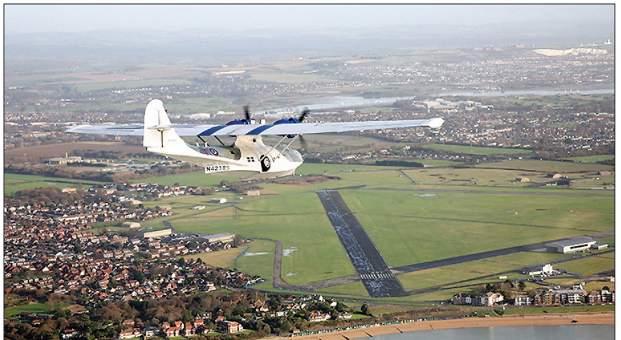
Flying high: A WW2 Catalina flies over Lee airfield where the Solent Enterprise Zone will be built at the former home of the Fleet Air Arm.

As he also sits on the Solent Local Enterprise Partnership (SLEP), Transport for South Hampshire and Isle of Wight