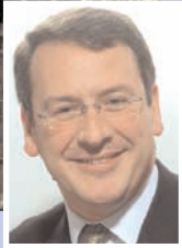
By Mark Hoban MP for Fareham

I am very proud of the young people in Fareham. Too often, young people get a bad press because of the actions of a tiny minority at the expense of the tremendous contribution that the majority makes to the wider community.