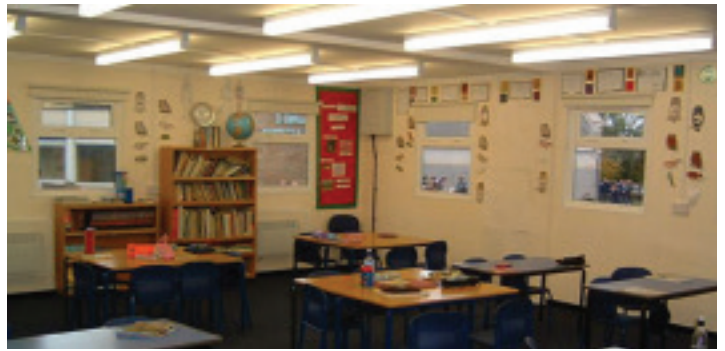
Temporary classrooms are now very smart.

been held. If there is sufficient support, the Diocese will publish a public notice, which will run from November 1 to December 14, outlining the intention to establish a new primary school.