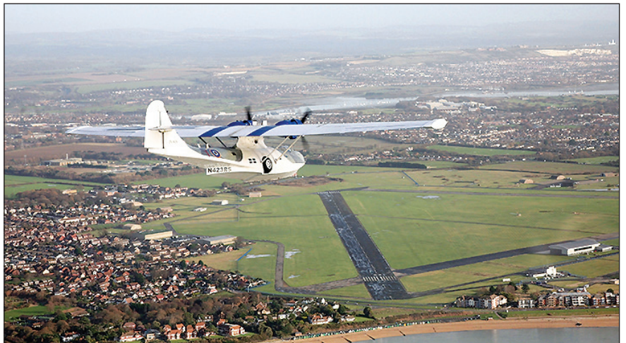
Flying high: A WW2 Catalina flies over Lee airfield where the Solent Enterprise Zone will be built at the former home of the Fleet Air Arm.

As he also sits on the Solent Local Enterprise Partnership (SLEP), Transport for South Hampshire and Isle of Wight