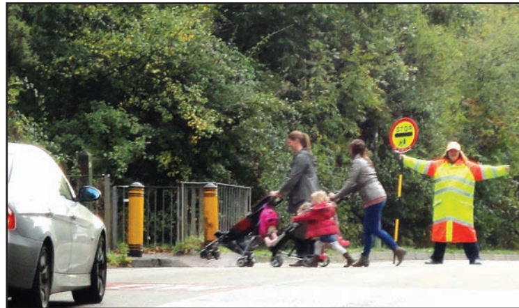
Lollipop lady: Staying, but only for a couple of weeks to allow people to get used to the new Toucan crossing, then moving to the junction with Rookery Avenue.

The fact is that 95% of the cost of the link was the roundabout on Botley Road, diversion of