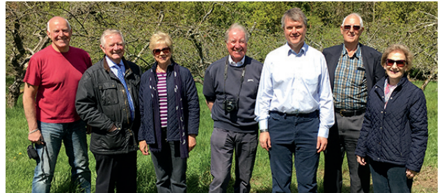
Tranquil: The beautifully restored pond. Above: Past and present councillors admire the orchard.