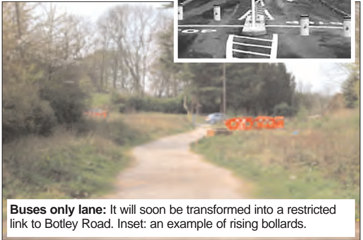
Buses only lane: It will soon be transformed into a restricted link to Botley Road. Inset: an example of rising bollards.