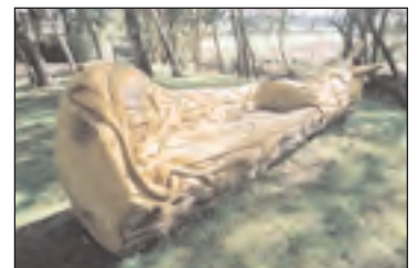
Carved: A chaise longue in wood.

did not benefit from any of the earlier works.